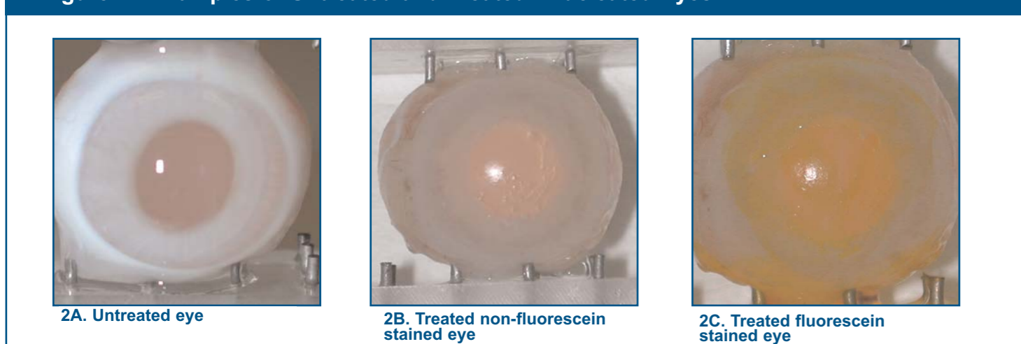
Figure 2 - Examples of Untreated and Treated Enucleated Eyes

1 In vivo data for compounds nos. 31 - 44 from ECETOC Technical Report No. 48, Eye Irritation: Reference Chemicals Data Bank (August 1992). ECETOC, Brussels.